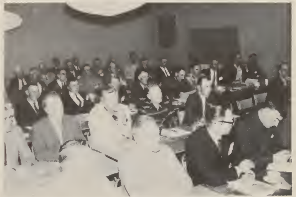
Sessions were informally conducted to allow for liberal discussion periods. By having no set program format, questions were allowed and welcomed from those in attendance.